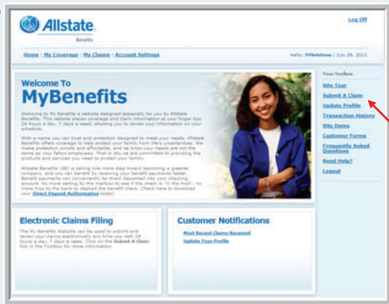
MyBenefits Home Screen, click "Submit A Claim"